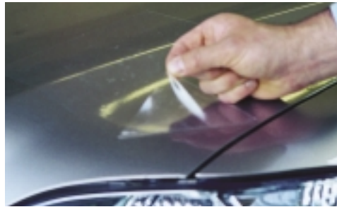
Optical clarity and high gloss

You can't see it, yet VentureShield™ is so tough it's used for abrasion protection on aircraft propellers and rotors!